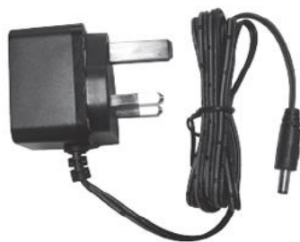
3 pin adaptor